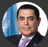
H.E. MR. NASSIR ABDULAZIZ AL-NASSER

High Representative United Nations Alliance of Civilizations