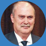
H.E. MR. FERIDUN HADI SINIRLIOGLU

Former Minister Counsellor for Political Affairs US Embassy in Rome