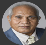
H.E. MR. TEBURORO TITO

Permanent Representative Permanent Mission of Bangladesh to the UN