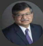
H.E. MR. MASUD BIN MOMEN

High Representative United Nations Alliance of Civilizations