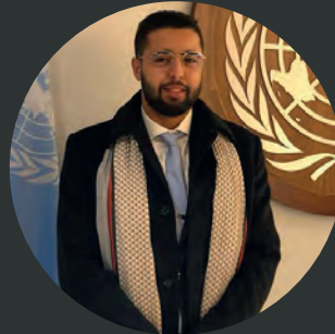
NACEUR SOULAIMANE ABOULOULA Deputy USG Logistics