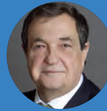
CRISTIÁN BARROS MELET

Former Permanent Representative Permanent Mission of Norway to the UN