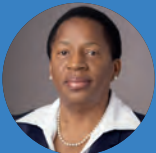
H.E. MS. PENNELOPE BECKLES

Permanent Representative Permanent Mission of Cyprus to the UN