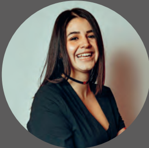
TEA BAGGIO USG Registration