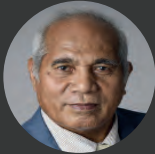
H.E. MR. TEBURORO TITO

Permanent Representative Permanent Mission of Bangladesh to the UN