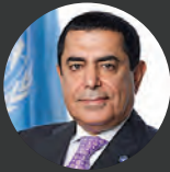
H.E. MR. NASSIR ABDULAZIZ AL-NASSER

High Representative United Nations Alliance of Civilizations